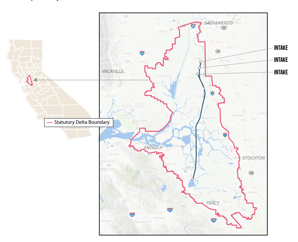
Figure 4 WaterFix Proposed Project Location