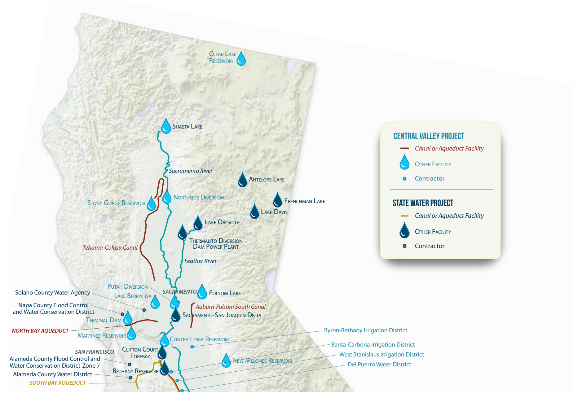
Figure 1 Water Contractors That Contributed to the Conservation and Conveyance Program and Their Key Facilities